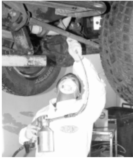
Waxoyl 120-4 being applied using sprayer with wand attachment to fill small and hard-to-reach areas.

bulk heads, door panels and posts, and rocker panels that ensures complete coverage in even the smallest folds and crevices. For coating the inside of frame rails, there are long flexible extension wands with specially designed spray heads that will offer complete coverage. Waxoyl 120-4 is much more effective when applied in this manner.