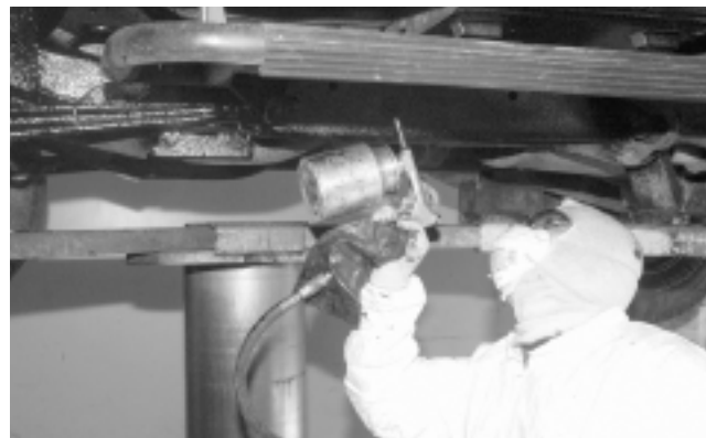
Waxoyl Hardwax being applied to the undercarriage.

Next we use wire brush scrubbers to remove any scale and flake under the vehicle. This particular Rover has been a pampered pet, so there is not a lot of flake rust to remove. On older, rusty trucks this part of the job can take longer.