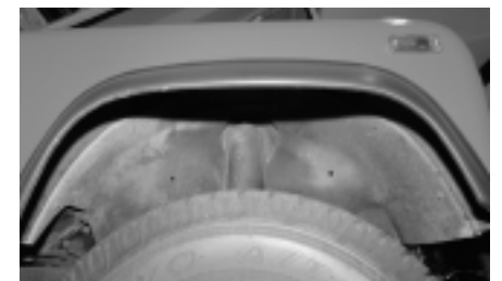
Before Waxoyl Hardwax application.

The most time consuming part of the job is fogging all the areas that can fill with water when off-roading. Conventional rustproofing is limited to spraying the underside of the vehicle and perhaps fogging the doors. Doing a good job on a Land Rover takes quite a bit more time and effort. Additionally, it helps to know your vehicle – you need to know where the nooks and crannies are in order to treat them!