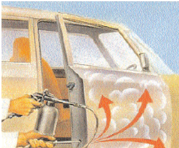
Professional Waxoyl 120-4 application fills all areas of door and body cavities.

Tar-based rustproofing products were marketed in the 1980s by several chain store operations. They have largely fallen into disuse. Tar based products are potentially hazardous, and they are difficult and messy to apply. They do not offer any benefits I can