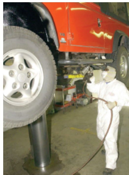
Hardwax undercoating being applied using Professional sprayer.

Waxoyl appointed Rovers North as the exclusive distributor of Waxoyl products for the Land Rover market, and they in turn signed Robison Service up as the pilot installation center. Rovers North offers Waxoyl products in bulk for professional installation and in spray cans for do-it-yourself use. Last summer, the Waxoyl factory rep came to Robison Service to train our staff on their products and applications.