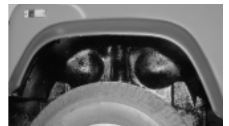
After Waxoyl Hardwax application.