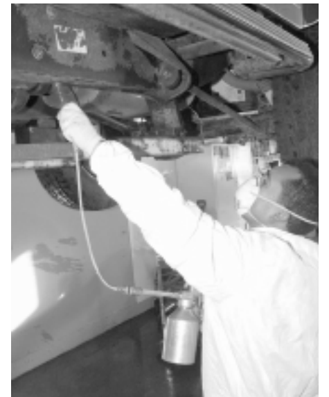
Waxoyl 120-4 being applied to inside of frame member.

After letting the Hardwax dry an hour or so we go back and spray a second coat into the areas where gravel and water spray from the wheels. Those areas (wheel wells and rockers) see the most wear. People who run in a lot of mud should anticipate touching up these areas periodically (spray cans of Hardwax will work fine for this), as they wear the Hardwax away.